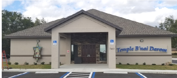
Our new building and sanctuary at 7465 SW 38 th St., Ocala, FL 34474